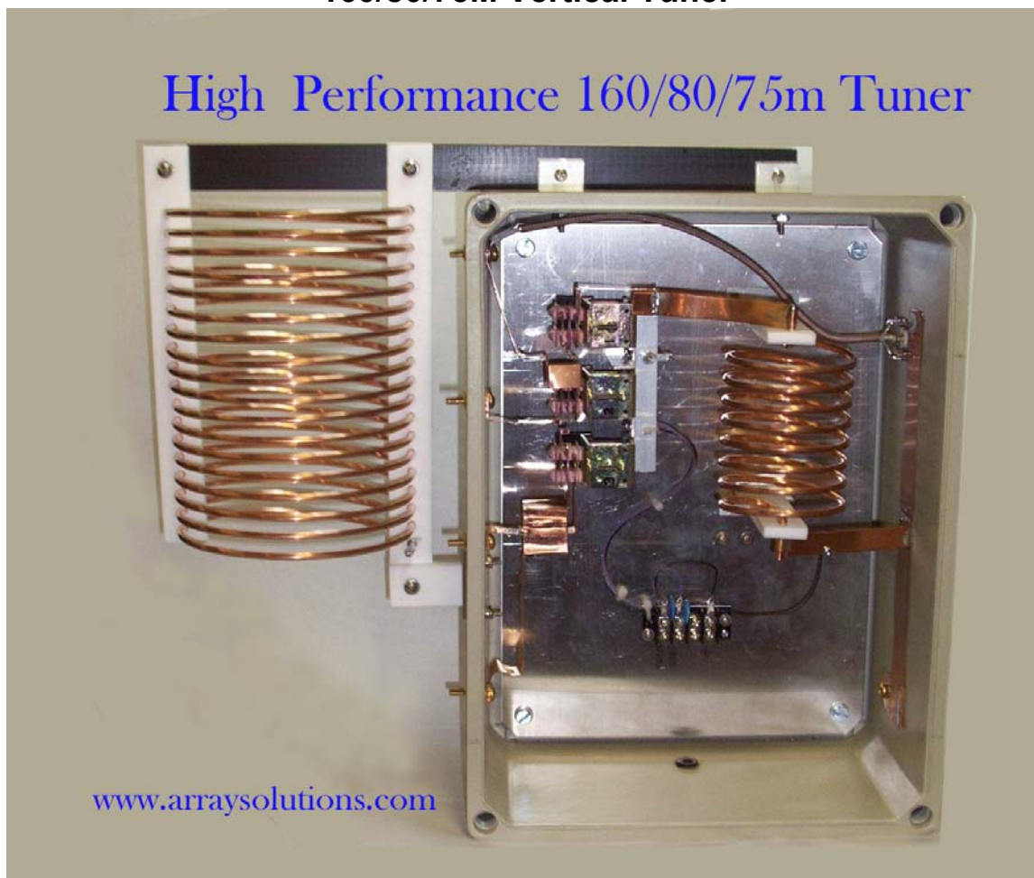
Array Solutions Tuner System for AS80V-FS or any 68-70 ft tall vertical