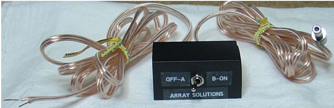
Array Solutions Power Control Switch

Bias-T PLUS. Double-sided tape is provided so that the Power Control Switch may be conveniently and firmly mounted at your operating position.