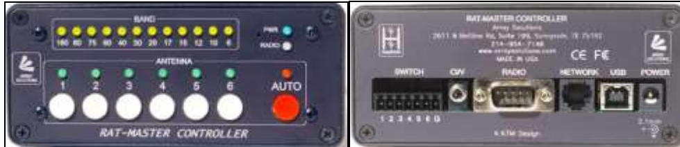
RatMaster, switch controller with integrated band decoder.

Please look in www.arrayolutions.com for the RatMaster and RatPak Push-Button controllers and its use with our Band Decoders like BandMaster III and BandMaster IV.