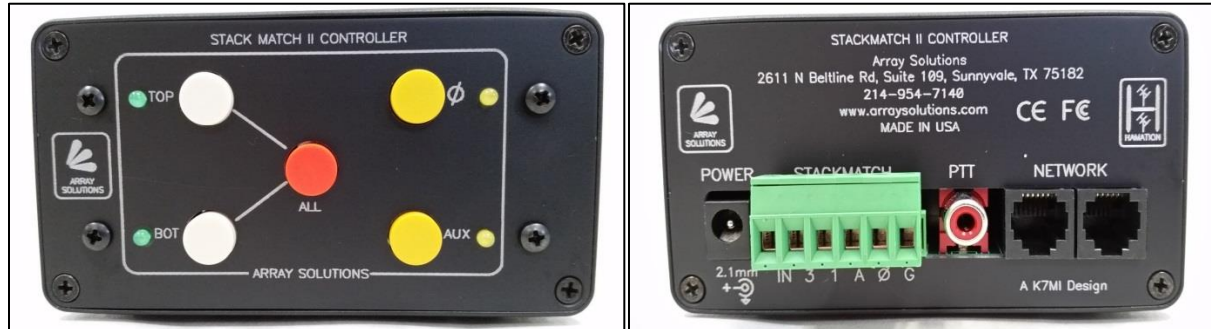
Front and rear views of the StackMatch-II Push Button Controller

The PB-2 Stack Match controller is a replacement for the rotary switch Stack Match controller. It features pushbutton switches for easy antenna selection and has outputs for both phase control and an auxiliary output. It is a component of the ShackLAN product line and as such can be fully remotely controlled via computer with our ShackLAN Control Center software. All outputs are switched with relay contacts for maximum reliability and power for the external switching unit may be applied from a separate power source to provide maximum isolation from the ShackLAN network. There is also a PTT input to allow different stack configurations for transmit and receive.