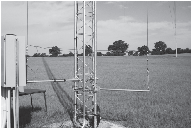
Figure 4—The insulated bottom of the skirt. Note the halo wires that tie the skirt wires together.