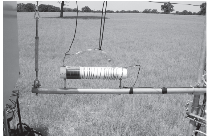
Figure 5—The LC network used to detune the tower. It's made of a coil of enamel wire and an RF capacitor.

tied together in a halo around the tower and attached to a detuning LC network to adjust the skirt to be nonresonant at the desired frequency. This is a much more rigorous application to build versus the Method 1 approach, but that's what we had to do. We built a 3-wire skirt using water pipe standoffs at the top, midway down (which were insulated), and at the bottom. See Figures 3 and 4.