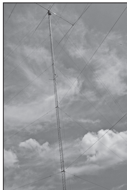
Figure 3—W5IZ’s tower with the detuning skirt (you have to look closely to see the wires around the tower).

Figure 2 shows a schematic diagram of a typical detuning skirt. It usually has 3 or more detuning wires running the full-length of a tower. The top wires are electrically attached to the tower. The lower end of the skirt is insulated from the tower,