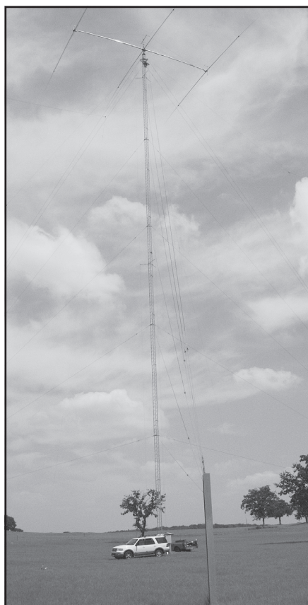
Figure 1—The 200 foot tower at W5IZ, with an 80-meter Yagi on top and a 4-Square system around it.

Doing some Internet research, we found that one solution was to create a loop around the tower at some midpoint. Then, we could drop a wire down below it at 40-60 feet and put a capacitor in series to tune the circuit to resonance. We tried this at various heights and we spent a lot of time without success. The tower was just not going to be detuned using this method no matter if we resonated the “loop” by increasing or decreasing the currents in it. We still had significant currents in the tower and this disturbed the pattern.